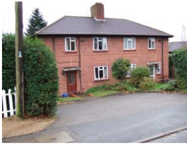
Old Cressex Road