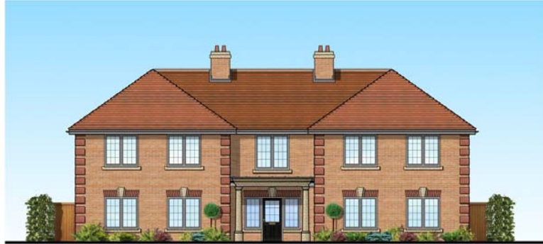
Proposed Front Elevation New accommodation for residents with learning disabilities

6 supported living flats for people with LD/ challenging behaviour